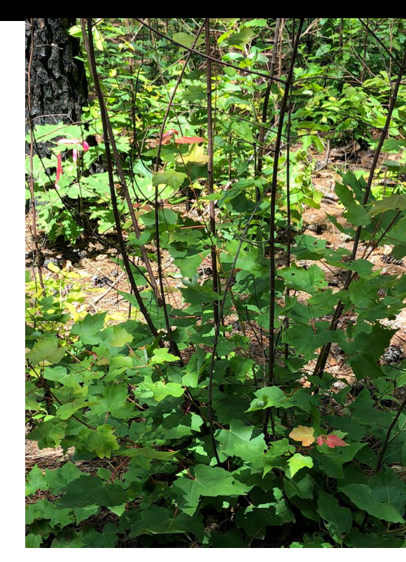
Red maple sprouts with dead "sentinels" (the outermost sprouts, killed by prescribed fire) and live stems on the Bankhead National Forest in Alabama.

economically. Fire does have a role to play in the restoration and sustainability of southeastern oak forests.