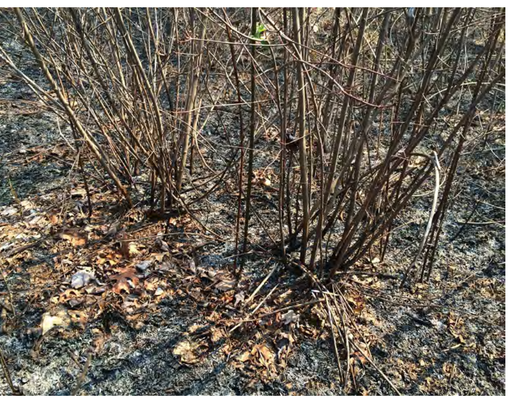
Red maple clumps and sprouts after three prescribed fires on the Bankhead National Forest in Alabama.

While we did not discuss the effects that fire may be having on residual tree quality, mortality, and timber value (Schweitzer and others 2019; Dey and others 2020, in this issue), the complex feedback between fire, fuels, and vegetation and the longterm rotation length in these systems must be considered (Dey and Schweitzer 2018). Without fire, these forests are moving away from a predominately oak composition; but how to favor oak is not exactly known in terms of the prescriptions that are most effective and efficient, both ecologically and