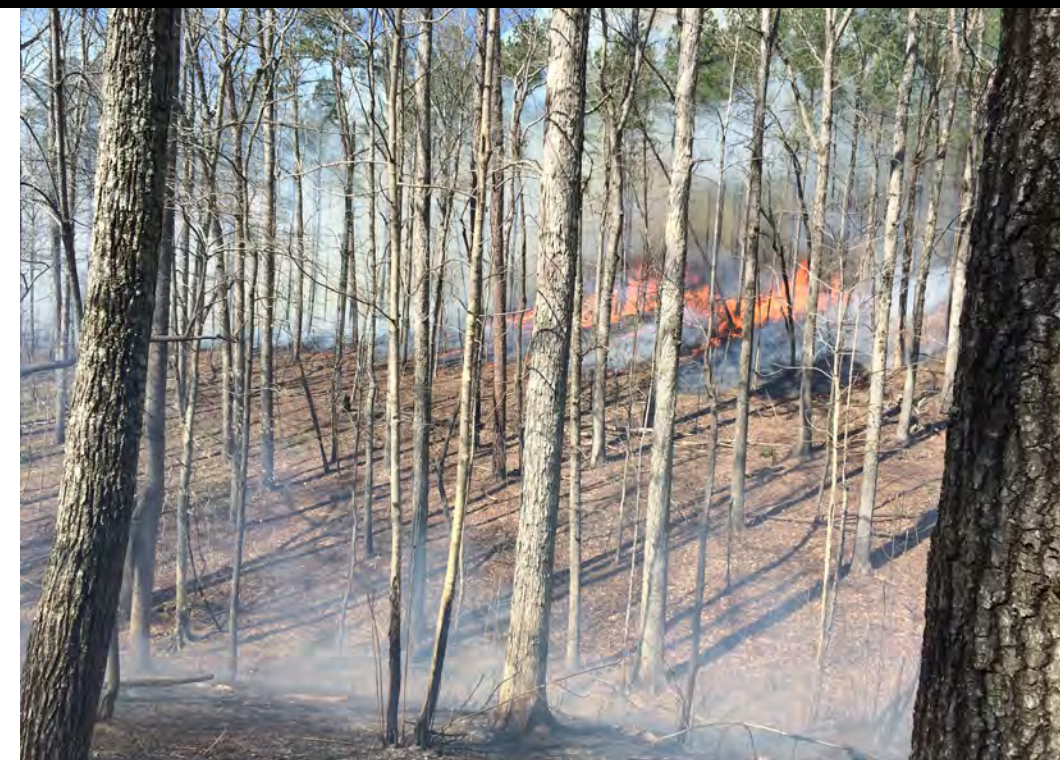
Typical dormant season fire on the Bankhead National Forest in Alabama.

Southeastern pine forests have long been managed using prescribed fire. In