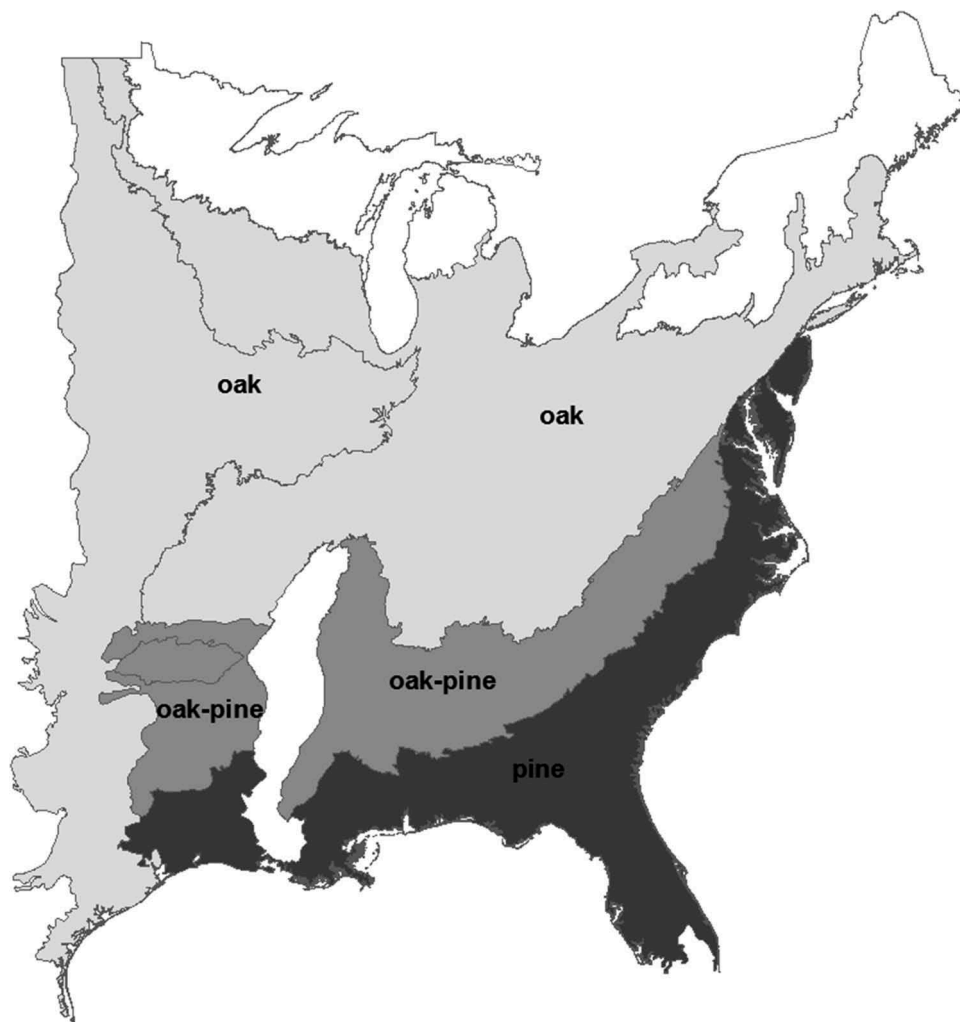
Figure 2. Regions dominated by historical oak and pine, which probably were open old growth forests. Other regions did not have a frequent low-severity fire regime because of climate limitations on fire, or alternatively, in flat dry grasslands, fire was too frequent to allow tree establishment.

et al. 2010). Although there are many potential drivers of open forest conditions, including herbivory, we believe the past presence of American bison was more of a consequence of open forests than a driver primarily because open forests occurred where bison were not present and bison are grazers rather than browsers (Hanberry and Abrams 2018). Additionally, despite current high populations of a browser, white-tailed deer ( Odocoileus virginianus ), herbivores have not controlled tree establishment that has created high-density closed forests at landscape scales.